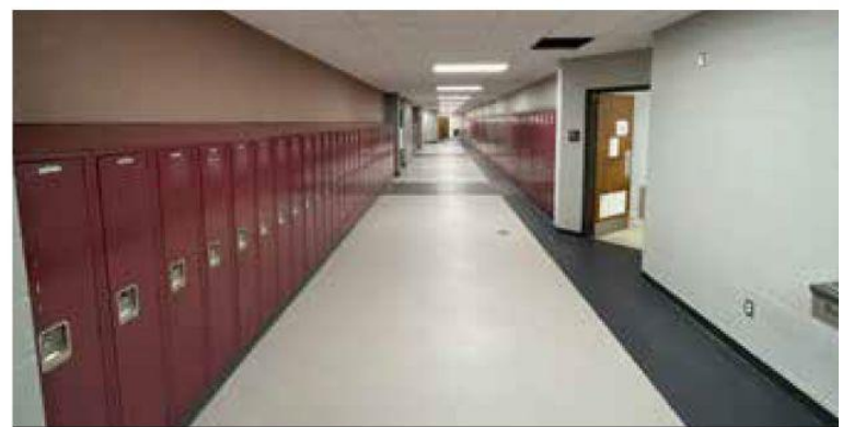
Middle School Wing New Flooring & Finishes