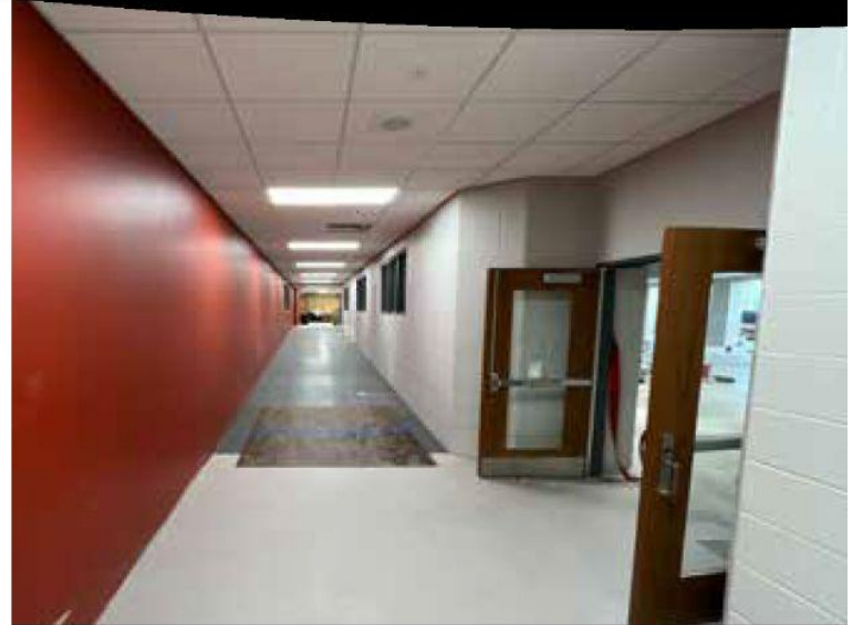
Corridor & Cafeteria Entrance