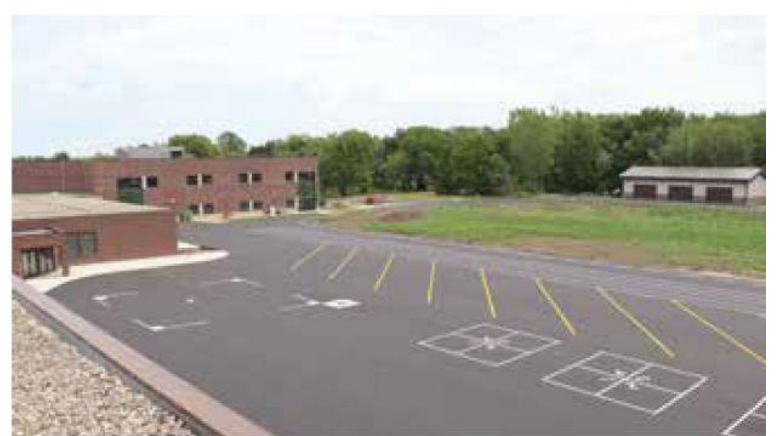
Play Area and Bus Loop