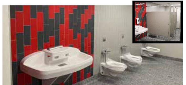
New 4 th & 5 th Grade Bathrooms